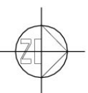
PLAN not to scale