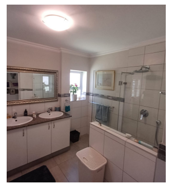
3 bed 2 bath

A stylish space for cooking, dining, and gathering.