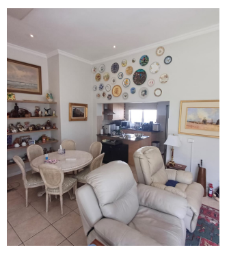
Open plan living

3 bedrooms, 2 bathrooms, including a spacious en-suite main