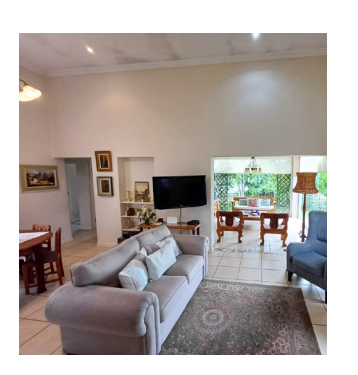
Open plan living

2 bedrooms, 1 full bathroom, 1 guest toilet.