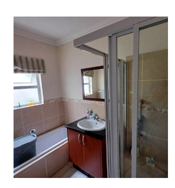
2 bed 2 bath

Welcoming kitchen with gas stove and oven.